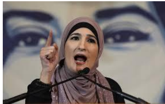
Linda Sarsour was a featured speaker at a MYNA youth event a week after the Hamas October 7 attack.