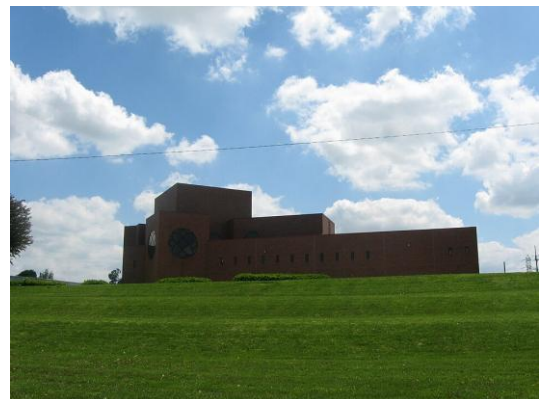
NAIT / ISNA headquarters in Plainfield, Indiana.

Federal courts established that NAIT was a member of the Brotherhood's Palestine Committee. The court order in United States v. Holy Land Foundation states that "during the early years of the Occupied Land Fund (OLF), later renamed the Holy Land Foundation for Relief and Development, OLF raised money and supported Hamas through an account held with ISNA and NAIT," and that some checks deposited into that account were "made payable to 'the Palestinian Mujahadeen,' which it describes as the original name of Hamas's military wing." Hundreds of thousands of dollars moved through that account to Hamas leader Mousa Abu Marzook and to Sheikh Ahmed Yassin's Islamic Center of Gaza. A 1993 Philadelphia wiretap of a Brotherhood Palestine Committee meeting captured participants discussing the use of "ISNA as official cover" for Hamas-linked activity.