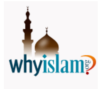
WhyIslam logo.