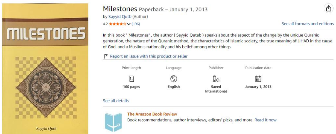
Qutb's Milestones for sale on Amazon.

These texts are not hard to come by. Walmart sells Qutb's Milestones through its third-party marketplace under the IBS imprint and the same titles are available through Amazon . ATP also produces K-12 instructional materials, including children's textbooks with teacher guides, study questions, and worksheets.