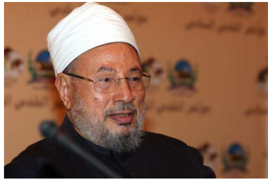
Yusuf al-Qaradawi.

Along with Ahmed Elkadi (whose father-in-law Mahmoud Abu-Saud was a senior Brotherhood figure in Egypt), they founded the North American Islamic Trust (NAIT) in 1973. 2