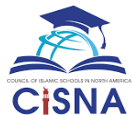
CISNA logo.