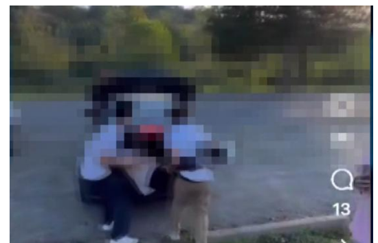
Mock kidnapping video posted by an MSA chapter at a Virginia high school.