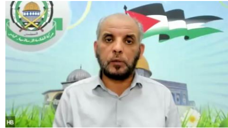
Husam Badran of Hamas appearing on a Samidoun / Masar Badil-organized webinar, Nov. 2023.

After Hamas’s October 7, 2023, massacre in southern Israel - in which roughly 1,200 people were murdered and over 250 people were taken hostage - Masar Badil and Samidoun openly celebrated and endorsed the attacks: 35