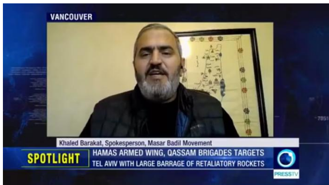
Barakat described on Iranian state media as Masar Badil spokesperson.

chants. The Vancouver Police Department recommended hate crime charges (willful promotion and public incitement of hatred). 99 As of April 2026, a decision regarding the charges has not been announced. 100