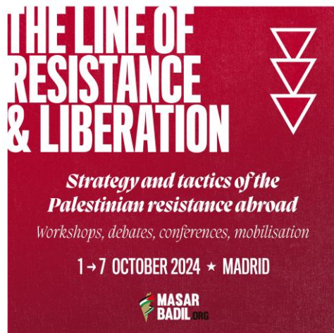
Flyer for Masar Badil’s 2024 conference.