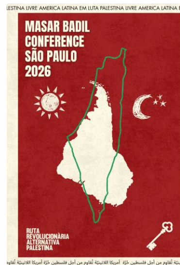
Poster advertising Masar Badil’s 2026 Brazil conference.

At Masar Badil’s annual conference in Madrid (October 3–7, 2024), the movement launched a new entity: the Tariq el-Tahrir Youth and Student Network , formally introduced on the 77th anniversary of the Nakba in May 2025 as Masar Badil’s youth wing. 29 Tariq el-Tahrir