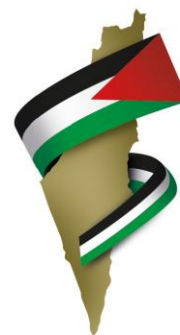
Masar Badil logo.