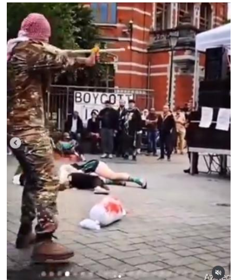
An Oct. 7 “reenactment” at the Samidoun “Resistance Festival” in Brussels, Oct. 2025.